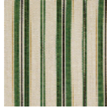
5062-04 DOMINICA - PRAIRIE