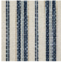
5062-08 DOMINICA - MARINE