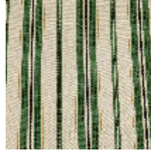
5062-04 DOMINICA - PRAIRIE