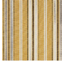
5062-03 DOMINICA - PAILLE