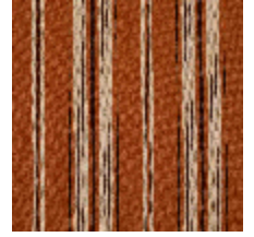
5062-06 DOMINICA - TOMETTE