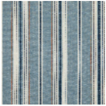
5062-07 DOMINICA - OCEAN