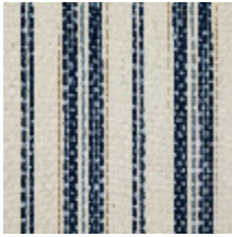
5062-08 DOMINICA - MARINE