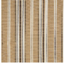
5062-01 DOMINICA - MUSCADE