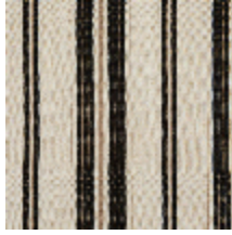
5062-02 DOMINICA - ECRU NOIR