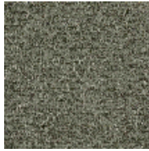
5063-09 PEPITE - CELADON