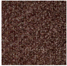
5063-07 PEPITE - BURGUNDY