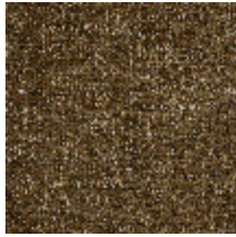
5063-08 PEPITE - BRONZE