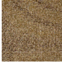
5063-03 PEPITE - MIEL