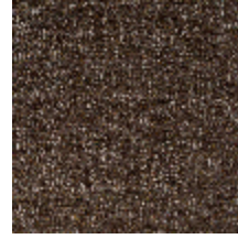
5063-05 PEPITE - CHOCOLAT