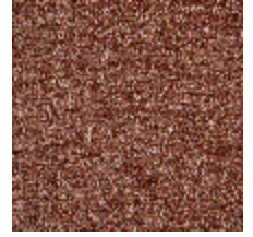
5063-06 PEPITE - BLUSH