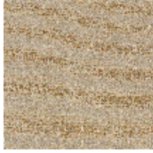
5063-02 PEPITE - NATUREL