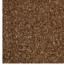
5063-04 PEPITE - CAMEL