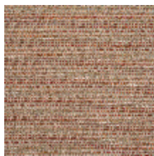
5064-03 VANNERIE - PAPIKA