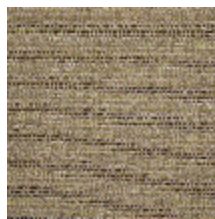
5064-04 VANNERIE - ABSINTHE