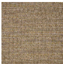
5064-02 VANNERIE - DORE