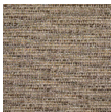
5064-01 VANNERIE - POIVRE