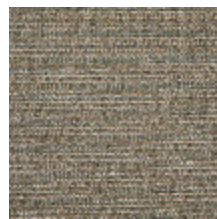
5064-05 VANNERIE - AGAVE