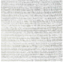
5069-01 SOLSTICE - BLANC