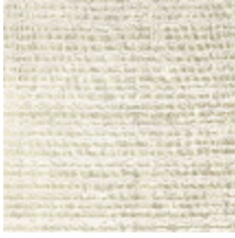
5069-02 SOLSTICE - NATUREL