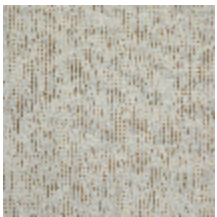
5072-01 MANIOC - NATUREL