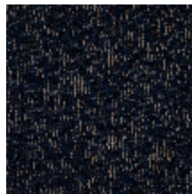
5072-04 MANIOC - NUIT