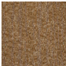
5072-02 MANIOC - CAMEL