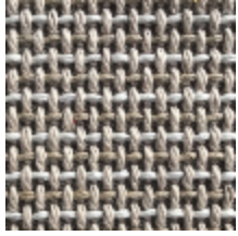
0508-02 CROSS - DAIM *