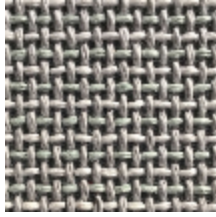
0508-03 CROSS - AGAVE *