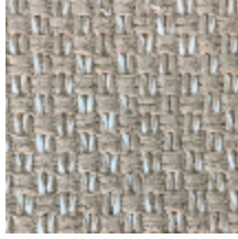
0509-02 SEED - DAIM