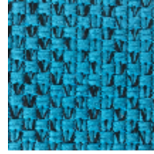
0509-06 SEED - TURQUOISE *