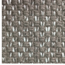
0509-03 SEED - TAUPE *