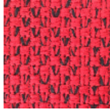
0509-05 SEED - ECARLATE *