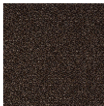
0513-07 MIX - TAUPE *