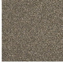
0513-03 MIX - CIMENT