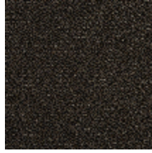
0513-08 MIX - ACIER *