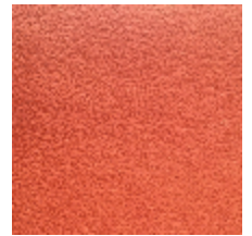
0533-13 WESTERN - FAUVE