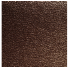
0533-08 WESTERN - OURS