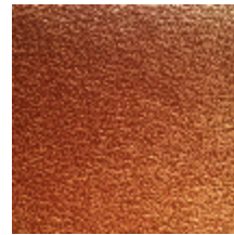
0533-12 WESTERN - COGNAC