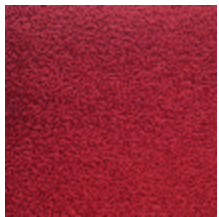
0533-15 WESTERN - BORDEAUX *