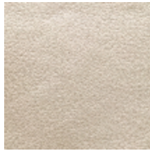
0533-03 WESTERN - RIZ