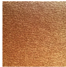
0533-11 WESTERN - ANTILOPE