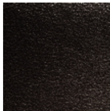
0533-17 WESTERN - TRUFFE