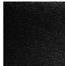
0533-19 WESTERN - NOIR