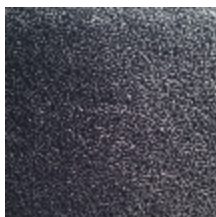
0533-22 WESTERN - ADRIATIQUE