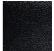
0533-20 WESTERN - MARINE *