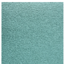
0533-21 WESTERN - FJORD