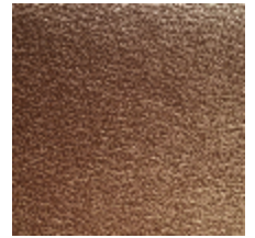
0533-07 WESTERN - TAUPE