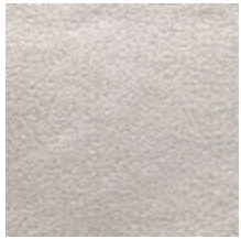
0533-01 WESTERN - CRAIE