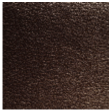
0533-09 WESTERN - ECORCE