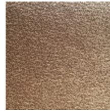
0533-05 WESTERN - TABAC