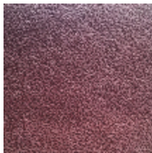
0533-16 WESTERN - BRUYERE *