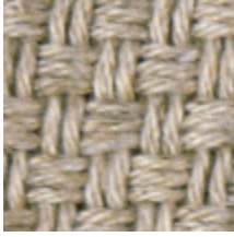
0536-02 OLUNIZ - SABLE