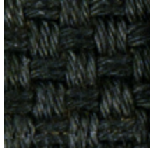
0536-05 OLUNIZ - CHARBON