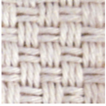
0536-01 OLUNIZ - CRAIE