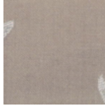
0539-05 ODALISQUE - GORGE DE PIGEON