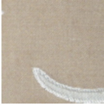
0539-02 ODALISQUE - PERLE