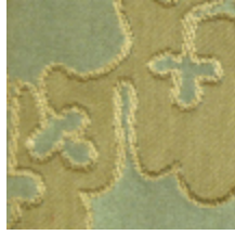
0539-04 ODALISQUE - CELADON