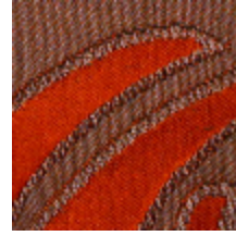
0539-06 ODALISQUE - CORNALINE