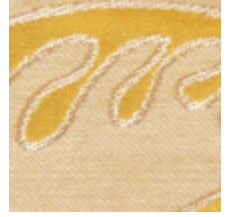
0539-03 ODALISQUE - OR *