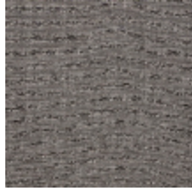
0554-03 KIMONO - POIVRE