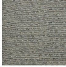
0554-04 KIMONO - FETUQUE