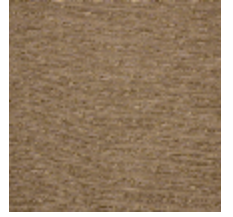
0554-06 KIMONO - COLZA