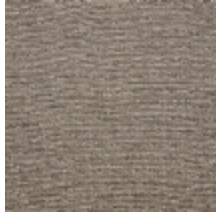
0554-02 KIMONO - LIN