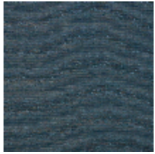
0554-07 KIMONO - CHARDON