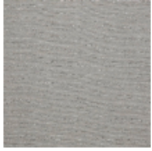
0554-01 KIMONO - RIZ