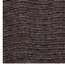
0554-05 KIMONO - ECORCE