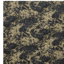
0555-05 NAMI - ETAIN