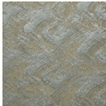
0555-02 NAMI - PLATINE