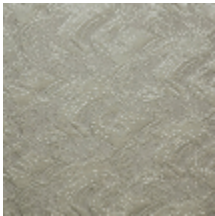
0555-01 NAMI - ECUME