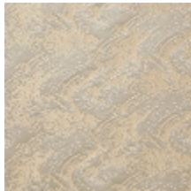
0555-03 NAMI - VERMEIL *