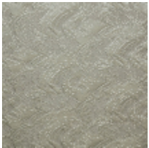
0555-01 NAMI - ECUME *