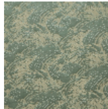
0555-04 NAMI - OPALINE