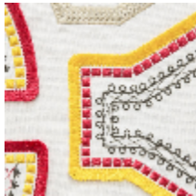
0561-02 KAYAPO - SORBET *