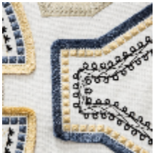
0561-01 KAYAPO - ANTIQUE