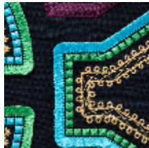
0561-03 KAYAPO - PERROQUET *