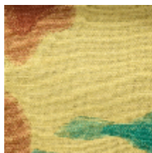
0562-03 BALI - NABIS *