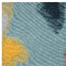
0562-01 BALI - AURORE *