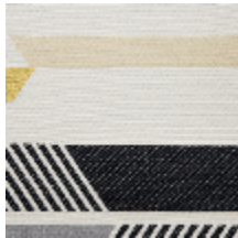
0563-02 GAUCHO - BAUHAUS *