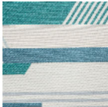
0563-01 GAUCHO - BALTIQUE *