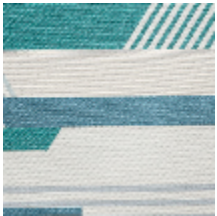
0563-01 GAUCHO - BALTIQUE *