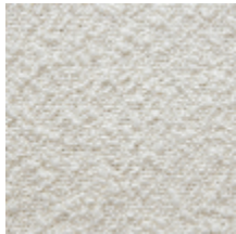
0565-01 LAMA - CRAIE