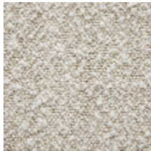
0565-02 LAMA - NATUREL