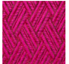
0568-10 VACOA - FUCHSIA *