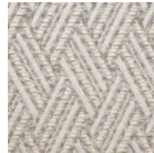
0568-05 VACOA - BRUME