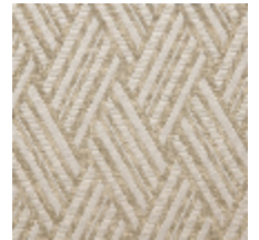
0568-06 VACOA - NATUREL