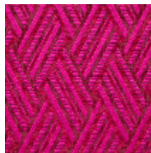
0568-10 VACOA - FUCHSIA