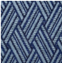
0568-02 VACOA - NAUTIQUE