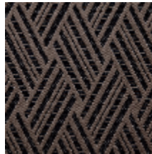
0568-04 VACOA - FUSAIN