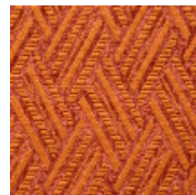
0568-11 VACOA - ABRICOT