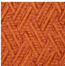
0568-11 VACO A - ABRICOT *