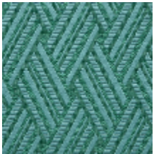
0568-01 VACOA - LAGON