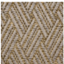
0568-07 VACOA - BRONZE