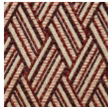
0568-09 VACOA - TOMETTE