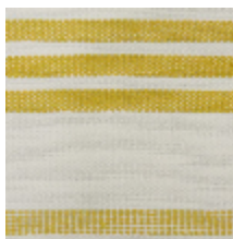
0573-02 MARINA - PASTIS