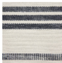
0573-04 MARINA - ORAGE