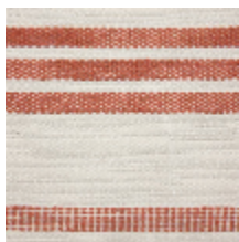
0573-01 MARINA - TERRACOTTA