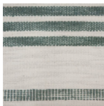
0573-03 MARINA - AGAVE