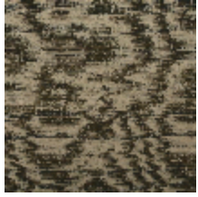
0581-01 RESSOURCE - OCRE *