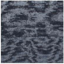
0581-10 RESSOURCE - MARIN *