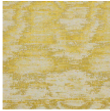
0581-12 RESSOURCE - SOLEIL *