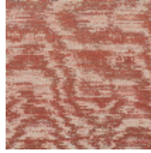
0581-07 RESSOURCE - TOMETTE *