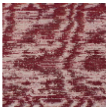
0581-08 RESSOURCE - CERISE