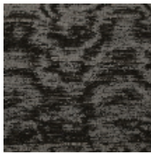
0581-02 RESSOURCE - EBENE