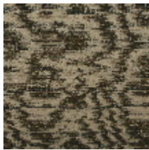
0581-01 RESSOURCE - OCRE