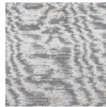
0581-05 RESSOURCE - GRANIT