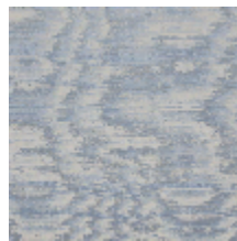
0581-11 RESSOURCE - CIEL