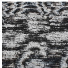
0581-03 RESSOURCE - POIVRE