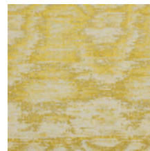
0581-12 RESSOURCE - SOLEIL