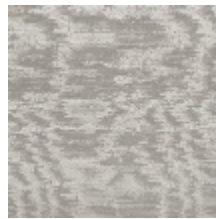
0581-04 RESSOURCE - NATUREL