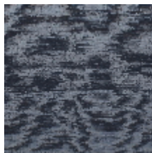
0581-10 RESSOURCE - MARIN *