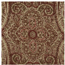
0582-01 PAISLEY – BOHEME