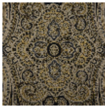
0582-02 PAISLEY – MORDORE