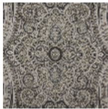
0582-03 PAISLEY – STEPPE