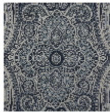
0582-04 PAISLEY – FAÏENCE