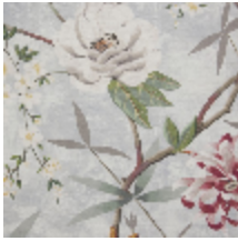
0583-02 PRINTEMPS DE CHINE - AQUA *