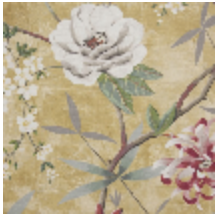
0583-01 PRINTEMPS DE CHINE - OR *