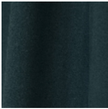
0603-14 DAIM - CANARD