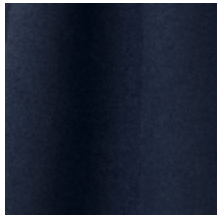
0603-13 DAIM - OUTREMER