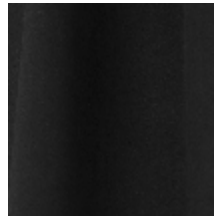
0603-10 DAIM - KHOL