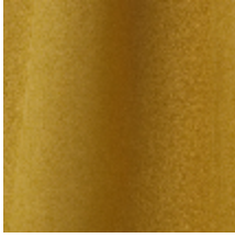
0603-02 DAIM - SAFRAN