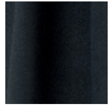
0603-12 DAIM - NAVY