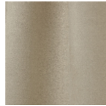
0603-17 DAIM - PIERRE