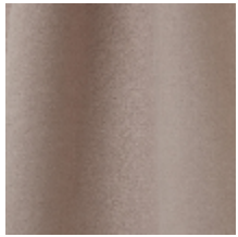
0603-07 DAIM - NUDE