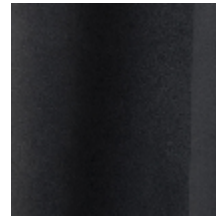
0603-11 DAIM - ARDOISE