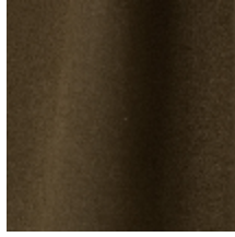
0603-03 DAIM - NOISETTE