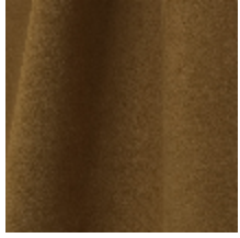
0603-01 DAIM - MORDORE