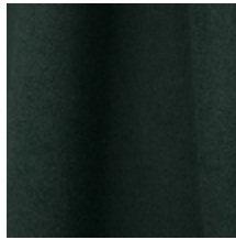
0603-09 DAIM - CEDRE