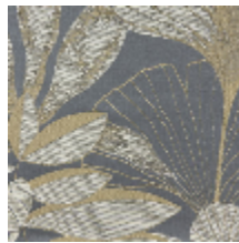
0609-04 HORTUS - ENCENS