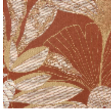
0609-03 HORTUS - SANTAL