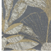
0609-04 HORTUS - ENCENS