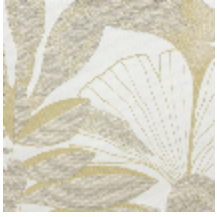
0609-01 HORTUS - KARITE