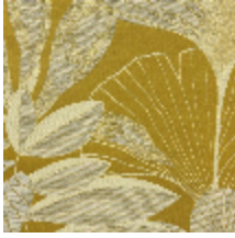
0609-02 HORTUS - RESINE