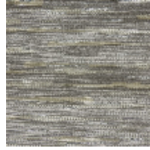
0611-05 MERISIER - ARGENT