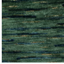
0611-03 MERISIER - EMERAUDE