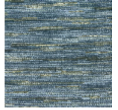
0611-06 MERISIER - CIEL