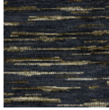
0611-04 MERISIER - FUSAIN