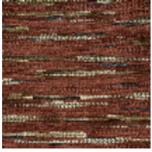
0611-01 MERISIER - ECUREUIL