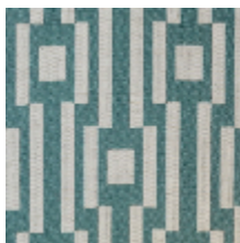
0615-02 OSIER - CELADON