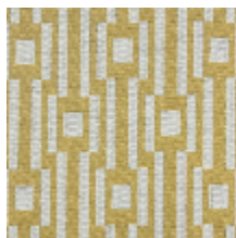
0615-03 OSIER - GENET