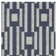
0615-01 OSIER - ARDOISE