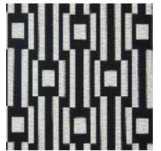
0615-06 OSIER - PAVOT