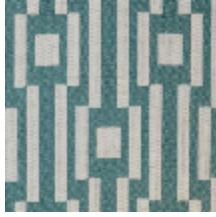
0615-02 OSIER - CELADON