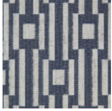
0615-01 OSIER - ARDOISE