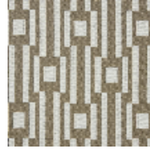
0615-05 OSIER - SISAL