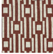
0615-04 OSIER - LAQUE