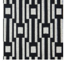
0615-06 OSIER - PAVOT