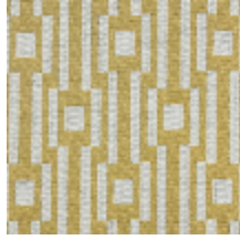
0615-03 OSIER - GENET