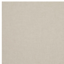
0616-45 SMART - ECRU