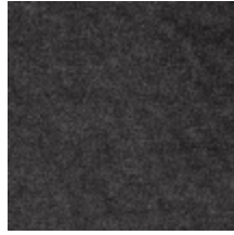
0616-28 SMART - CHARBON