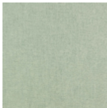
0616-44 SMART - CELADON