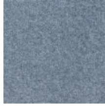
0616-04 SMART - JEAN