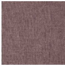
0616-37 SMART - TOURTERELLE