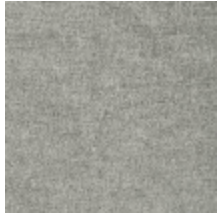
0616-25 SMART - PIERRE