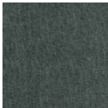
0616-43 SMART - EUCALYPTUS