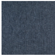
0616-39 SMART - PRUSSE