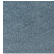
0616-05 SMART - ARCTIQUE