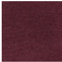
0616-09 SMART - BORDEAUX