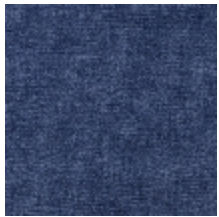
0616-07 SMART - INDIGO