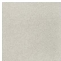
0616-22 SMART - NOUGAT