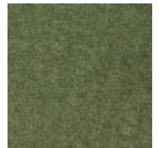
0616-18 SMART - ALOES