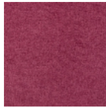
0616-10 SMART - PIVOINE