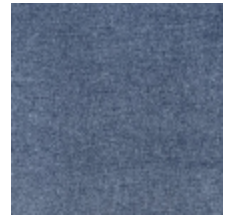
0616-06 SMART - MARIN