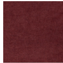
0616-11 SMART - BOURGOGNE