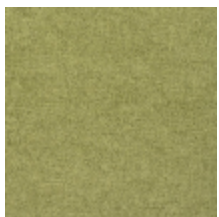
0616-19 SMART - PRAIRIE