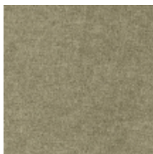
0616-20 SMART - AMANDE