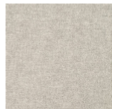
0616-24 SMART - FICELLE