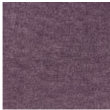
0616-08 SMART - AMETHYSTE