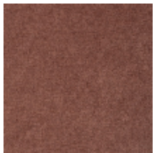
0616-13 SMART - AUTOMNE