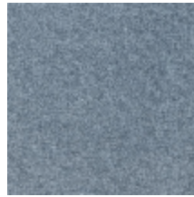
0616-04 SMART - JEAN