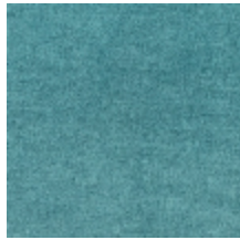
0616-03 SMART - TURQUOISE