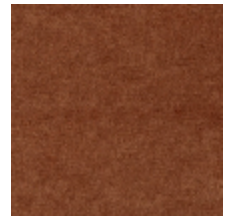
0616-12 SMART - SIENNE