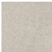
0616-21 SMART - DUNE