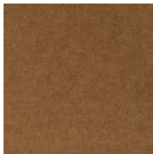
0616-14 SMART - HAVANE