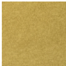
0616-15 SMART - MORDORE