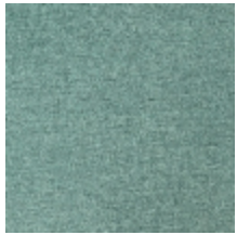
0616-01 SMART - LAGON