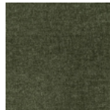
0616-17 SMART - PIN