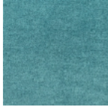
0616-03 SMART - TURQUOISE