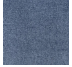
0616-06 SMART - MARIN