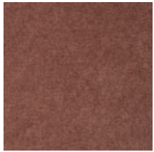
0616-13 SMART - AUTOMNE