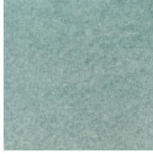
0616-02 SMART - AQUA