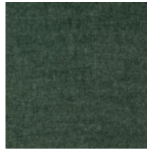
0616-16 SMART - CEDRE