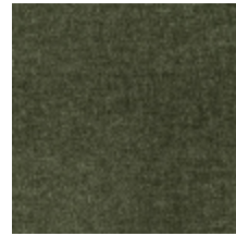
0616-17 SMART - PIN