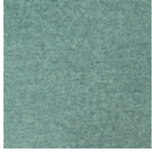
0616-01 SMART - LAGON