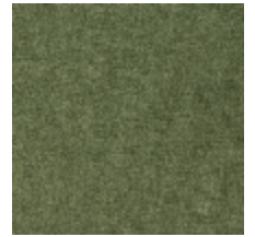
0616-18 SMART - ALOES