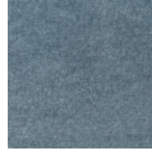
0616-05 SMART - ARCTIQUE