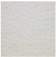
0625-01 KOSI - BLANC