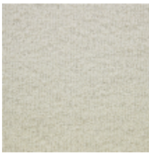
0625-02 KOSI - IVOIRE