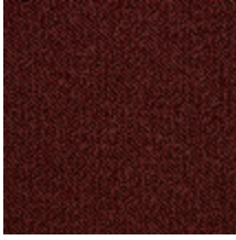
0626-02 SHERPAS - SIENNE