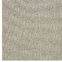
0626-04 SHERPAS - DUNE