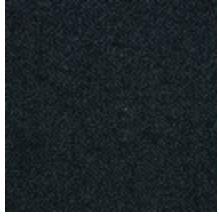
0626-01 SHERPAS - CANARD