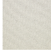
0626-05 SHERPAS - CRAIE