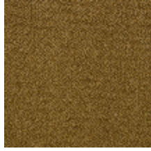
0626-03 SHERPAS - MOUTARDE