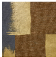
0628-04 LHASSA - MORDORE