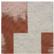
0628-01 LHASA - CUIVRE