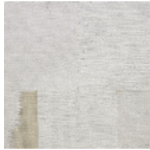
0628-03 LHASSA - NACRE