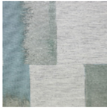
0628-02 LHASSA - CELADON