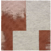
0628-01 LHASSA - CUIVRE