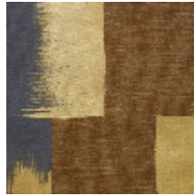
0628-04 LHASSA - MORDORE