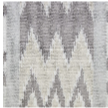
0629-03 EVEREST - ARGENT