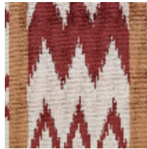
0629-04 EVEREST - TERRACOTTA