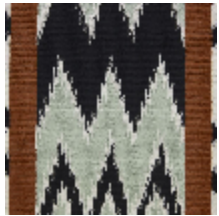
0629-01 EVEREST - ECAILLE