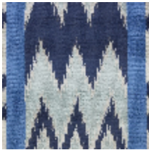
0629-02 EVEREST - OCEAN