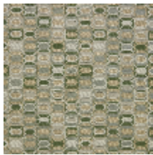
0630-02 KHAN - JADE