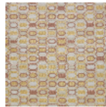
0630-05 KHAN - QUARTZ