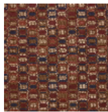
0630-04 KHAN - CORNALINE