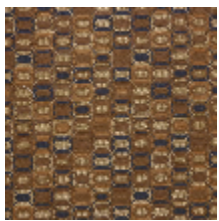
0630-01 KHAN - MORDORE