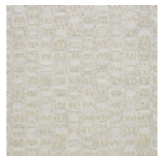
0630-06 KHAN - NACRE