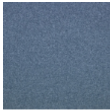
0633-09 WOOLY - DENIM