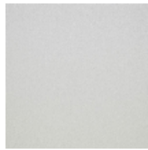
0633-16 WOOLY - PERLE