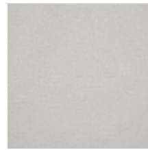
0633-17 WOOLY - CRAIE