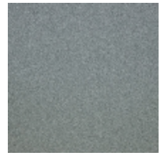
0633-12 WOOLY - CENDRE