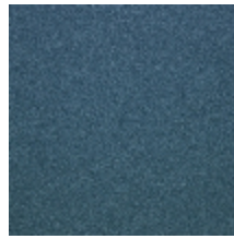
0633-10 WOOLY - PETROLE