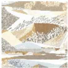
0635-01 ALTITUDE - GLACIER