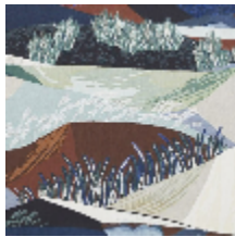
0635-02 ALTITUDE - CRÉPUSCULE