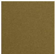
0638-13 TAÏGA - ANIS