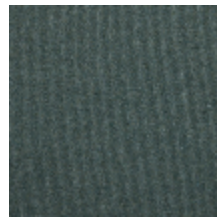
0638-17 TAÏGA - SAUGE