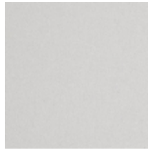
0638-04 TAÏGA - PERLE