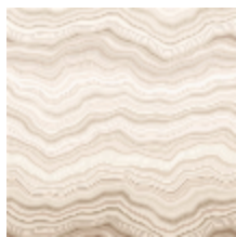
6446-01 CARRARE MARBRE